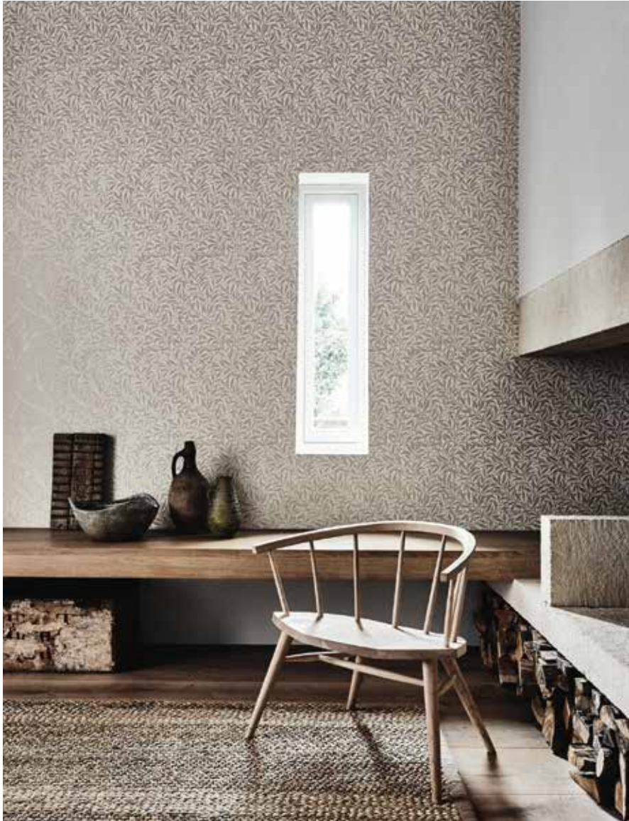
Above Left: WALLPAPER Pure Willow Bough 216023, Far Right: WALLPAPER Pure Bachelors Button 216050, SOFA Ruskin 231452