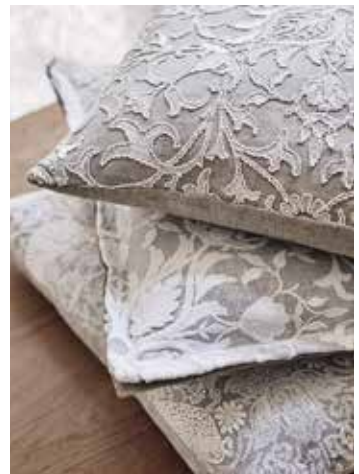
Left: CURTAINS FROM LEFT Pure Net Ceiling Embroidery 236077, Pure Ceiling Embroidery 236069, Above Top: WALLPAPER Pure Poppy 216032, Above Bottom Centre: TABLE CLOTH Pure Strawberry Thief 226061, Above Bottom Right: CUSHIONS FROM TOP Pure Net Ceiling Embroidery 236076 backed with Ruskin 231452, Pure Net Ceiling Applique 236075, Pure Strawberry Thief 236073