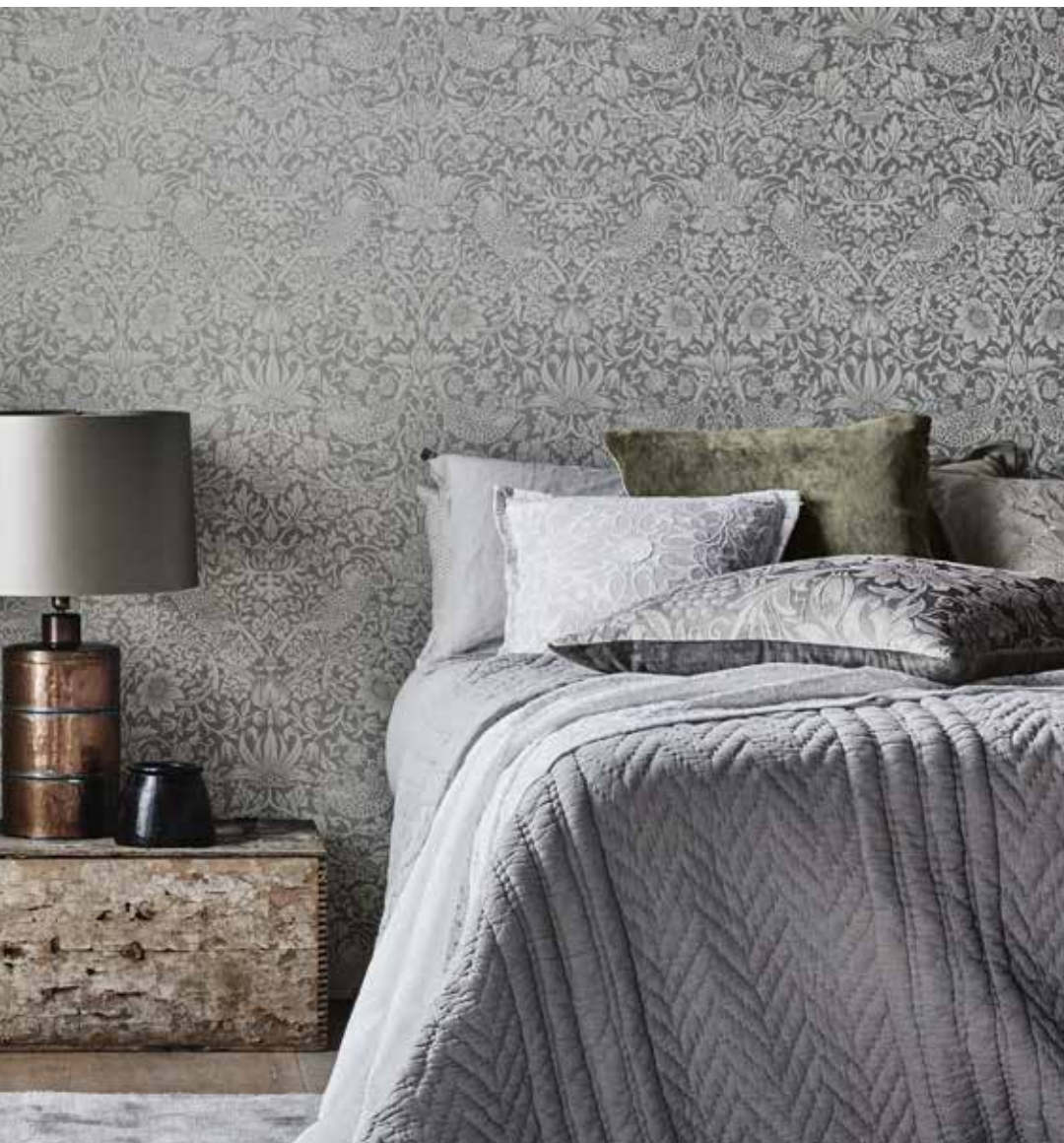
Left Top: Pure Poppy Embroidery 236081, Left Bottom: CUSHIONS FROM LEFT Pure Strawberry Thief Embroidery 236073, Pure Net Ceiling Applique 236075 BED THROW Pure Net Ceiling Applique 236075, Above: WALLPAPER Pure Strawberry Thief 216017 CUSHIONS FROM LEFT BACK ROW Ruskin 231452, Boho Velvet 235261, Pure Poppy Embroidery 236081 CUSHION MIDDLE ROW Pure Net Ceiling Applique 236075 CUSHION FOREGROUND Pure Sunflower 236167 backed with Boho Velvet 235266