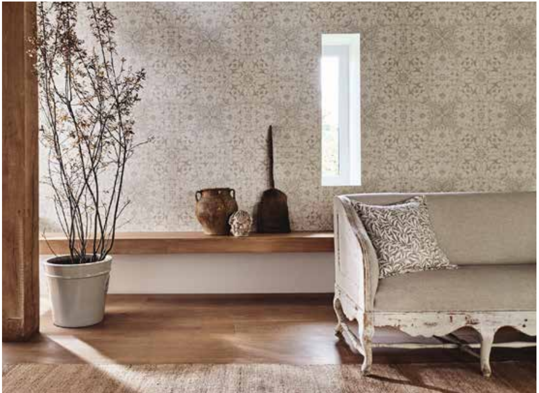
Above: WALLPAPER Pure Net Ceiling 216038 CUSHION Pure Willow Bough 236066 SOFA Ruskin 231452